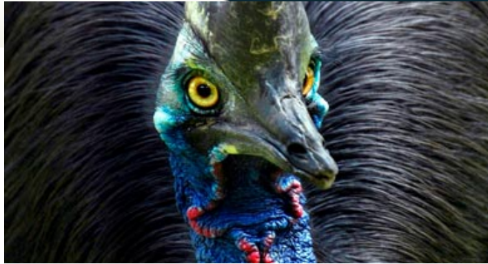
The Cassowary bird at Lahore Zoo.